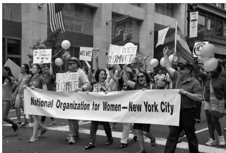
NOW-NYC gives a spirited cheer for gay rights. — June 26