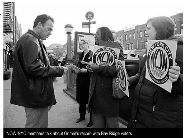
NOW-NYC members talk about Grimm's record with Bay Ridge voters.

How did someone with such strong views against women and health care make it to such a high-powered position in New York City? Grimm's narrow special election win in November 2010, where he squeaked by with 51% of the vote, was fueled by out-of-